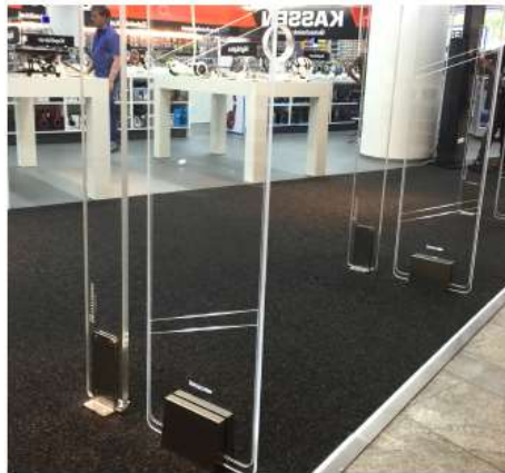
Shopguard Twilight EAS and HyperGuard installation